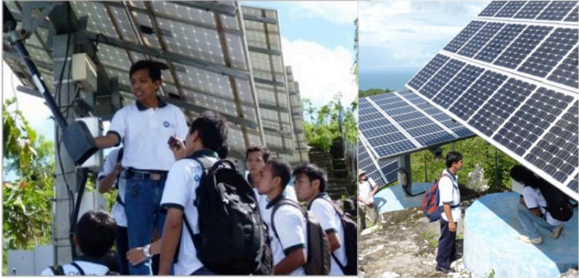
Fig.2: The STTNAS study tour at a PV water pumping system in Jogjakarta in June 2010, undertaken as part of the UNSW-ADRA/AusAID research project activities, 2008-2011.